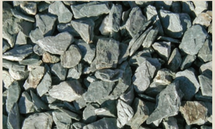
Grey Green Slate 1 1/2"