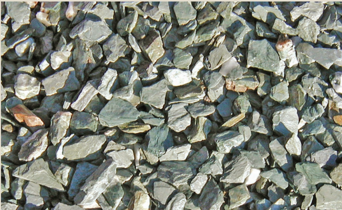
Grey Green Slate 3/4"