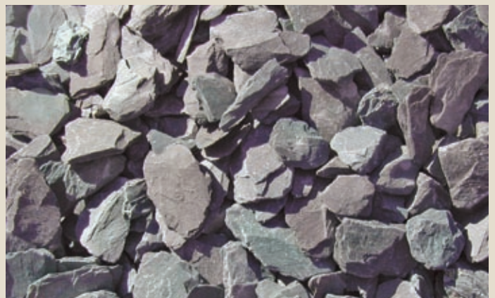
Mottled Purple Green Slate 1 1/2"