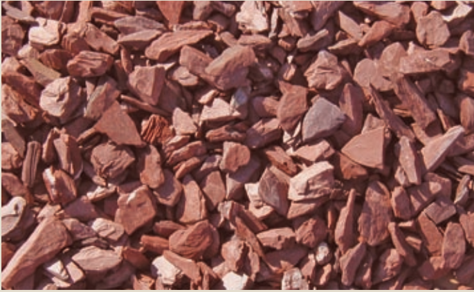
Red Slate 3/4"