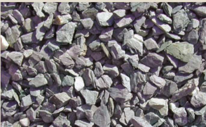
Mottled Purple Green Slate 3/4"