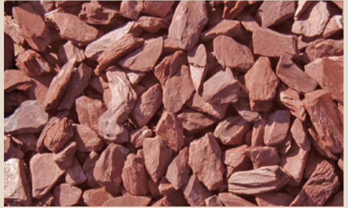
Red Slate 1 1/2"