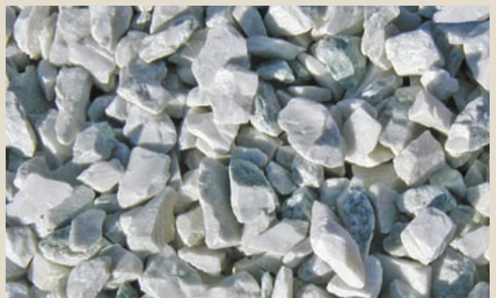
Marble 1 1/4"