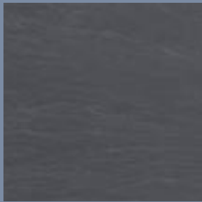
18" x 18" x 3/8"