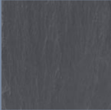
24" x 24" x 1/2"

In addition to the patterns shown at right, slate is available in the following uniform single sizes. (Last dimension shown is the minimum thickness available.)