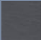
9" x 9" x 1/4"