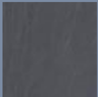
12" x 12" x 1/4"