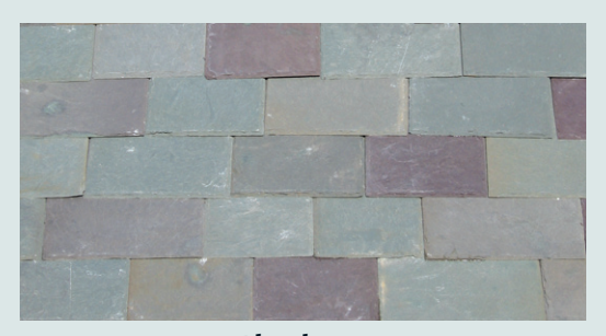
Evergreen Manor Blend