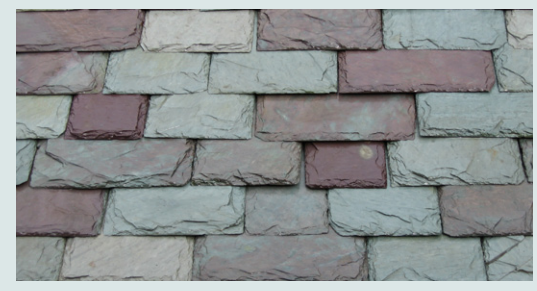
Evergreen Imperial Blend