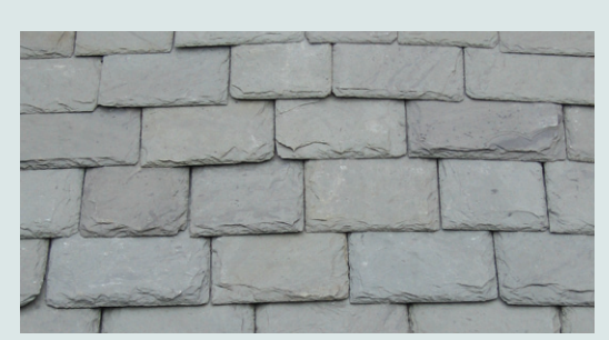
Evergreen Splendor Blend

For additional texture, several thicknesses can be intermingled in each course of slate.